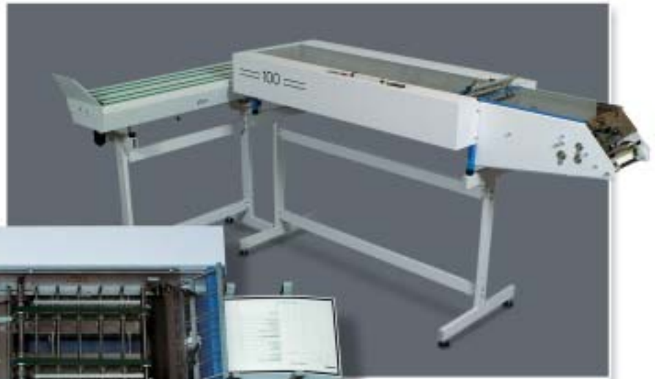
Options on request e.g. conveyor stacker and integrated burster