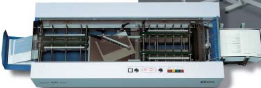
From form to finished mailer